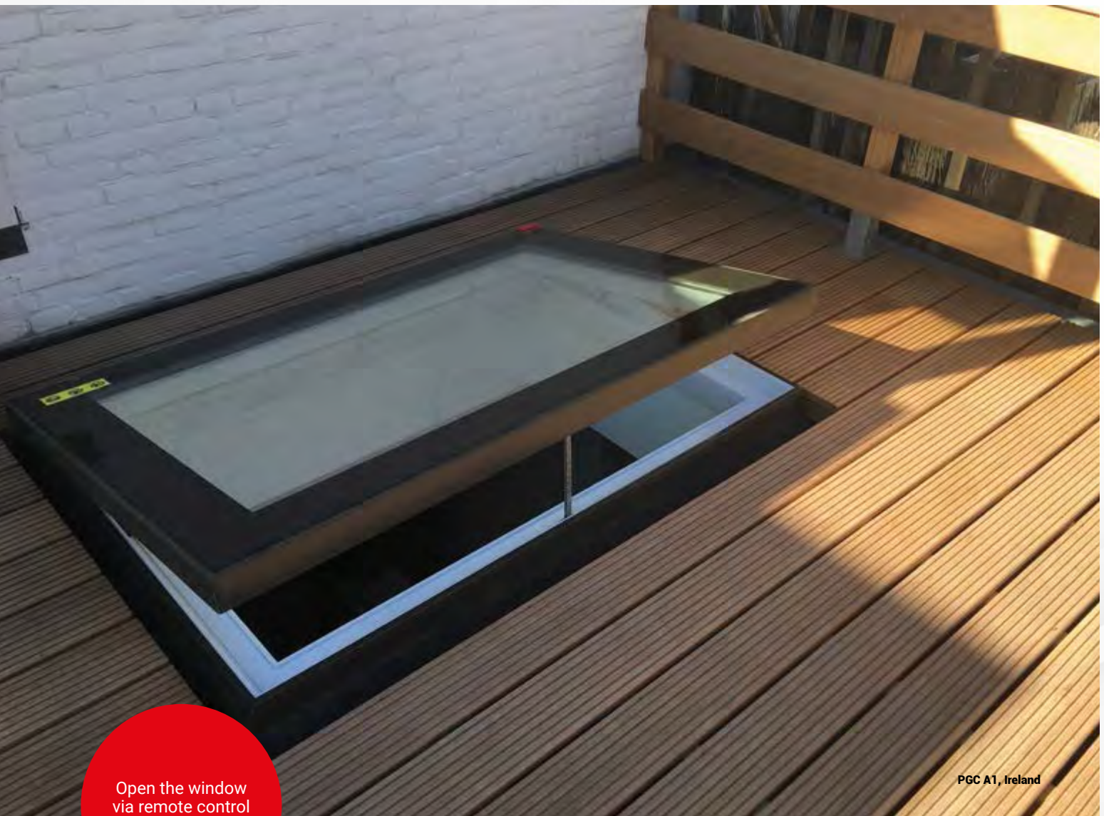
PGC A1, Ireland

Open the window via remote control and let the fresh air in